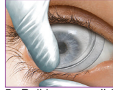
5. Pull lower eyelid down and slide PROKERA PLUS under the lower eyelid