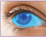
1. Apply topical anesthesia