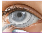
3. Lift lower edge of PROKERA PLUS using a cotton swab or blunt forceps