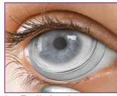
2. Pull the lower eyelid down