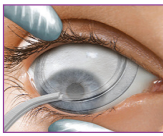
4. Ask the patient to look down