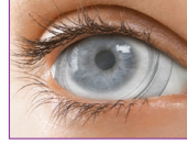
6. Check centration under the slit lamp