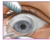
6. Slide the PROKERA PLUS out