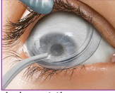
4. Insert the PROKERA PLUS into the superior fornix