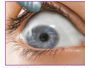
3. Ask the patient to look down