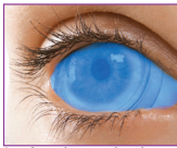
1. Apply topical anesthesia