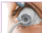
4. Insert the PROKERA into the superior fornix